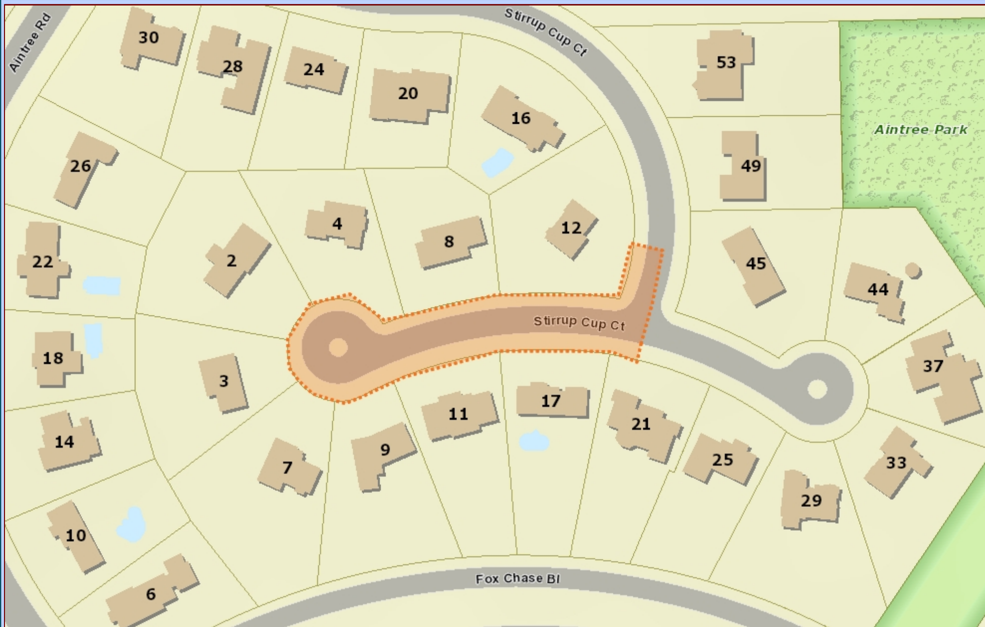
2022 - Project Area